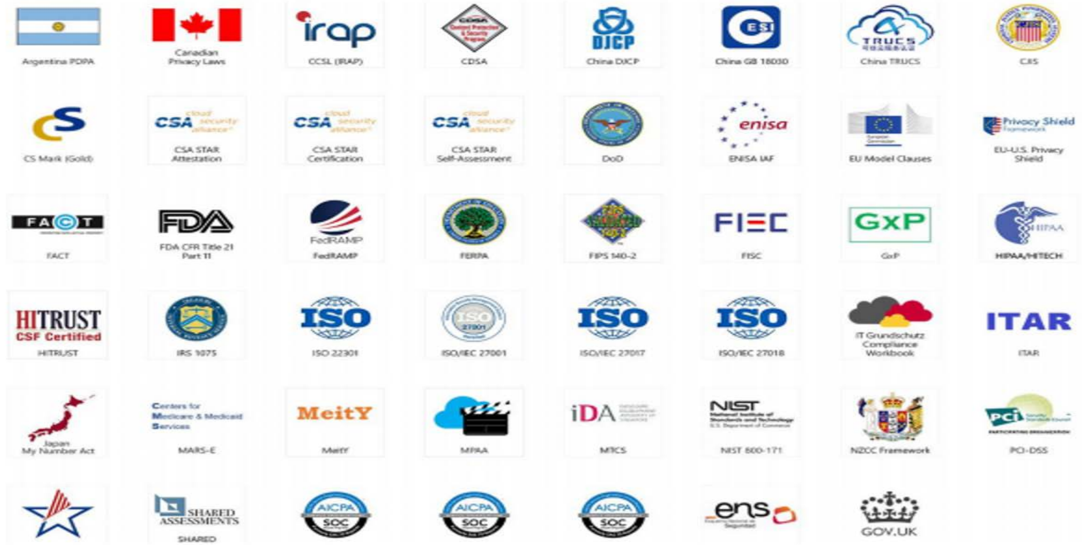
Fig1. Compliance Templates Provided By Microsoft